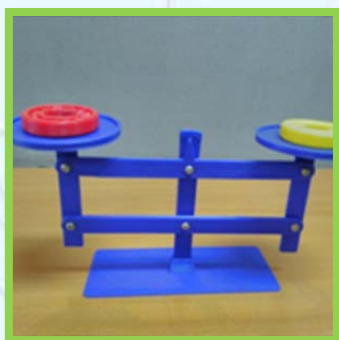
Roberval Balance Activity