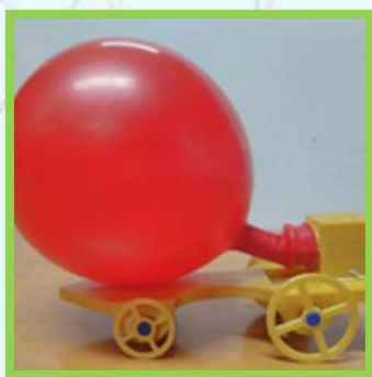
Jet Propulsion Balloon Rocket Car Activity