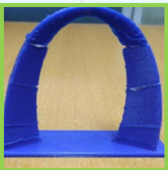
Gateway Arch Puzzle Activity