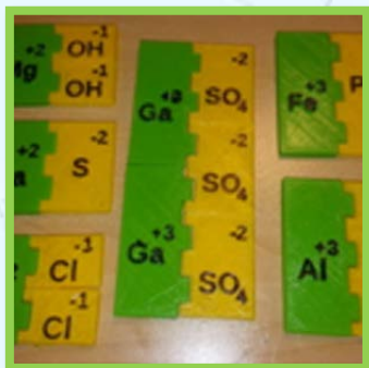
Ionic Bonding Model Activity