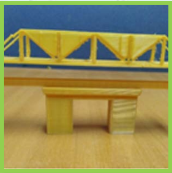
Bridge Building Activity