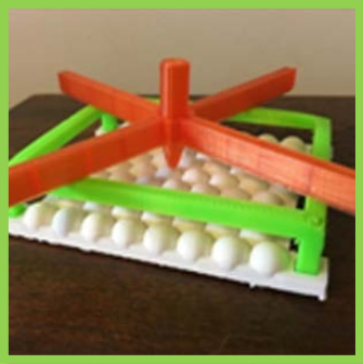
Atomic Force Microscope Model Activity