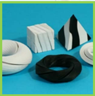
Five Screw Puzzles Activity