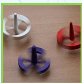
Spinning Top Orbital Series Activity