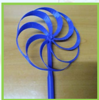
Optical Illusion Pinwheel Activity