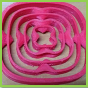
Air Spinner Activity