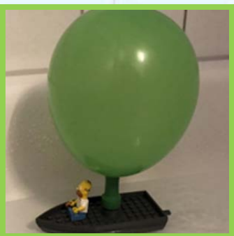
Lightweight Glider Activity