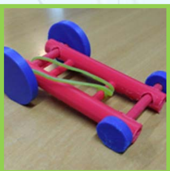
Robberband Car Activity