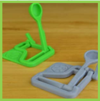
Balloon Boat Activity